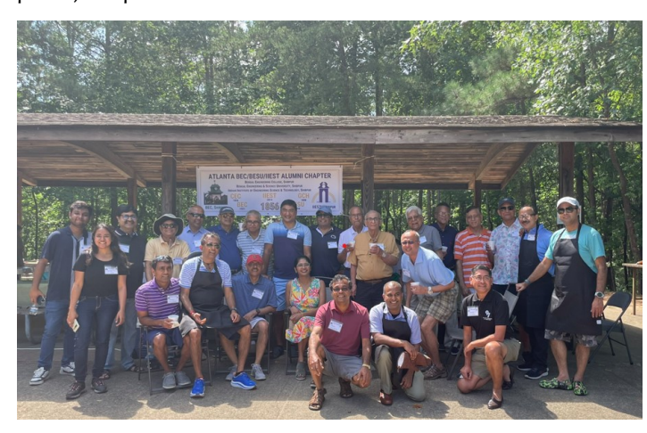
Picture 1: A snapshot of Atlanta Area Alumni present at the 2023 Picnic

GCH, BEC, BESU and IIEST was another highlight of this year's picnic; see pictures below: