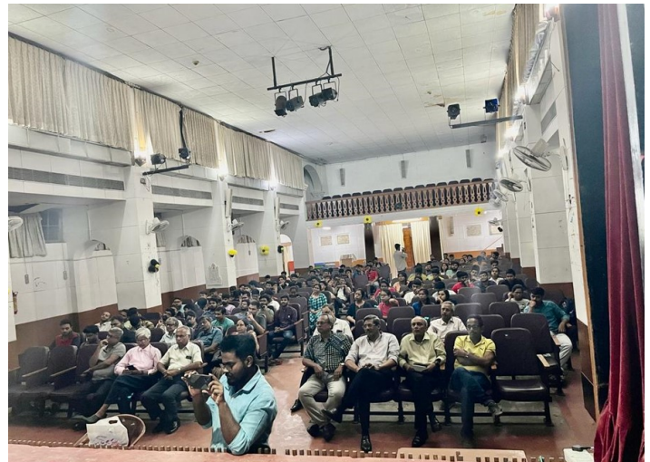
REPORT ON B.E.COLLEGE EX-STUDENTS' CLUB,