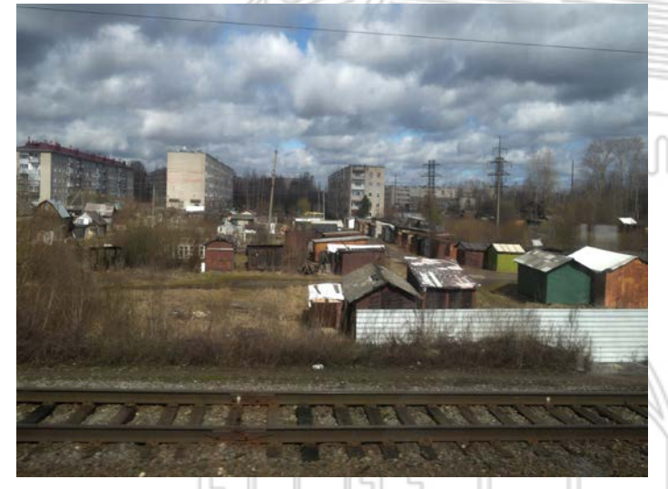
সেসব স্টেশনে আমাদের থামা হয়নি যদিও | এই সব দেখতে দেখতে চলছিলাম, আবার বেশ কয়েকবার দেখা হল সকালের ভদ্রলোকের সাথে | আস্তে আস্তে

সেটশন টা ছিল নোভোসিবিরিস্ক — সাইবেরিয়ার সব চেয়ে জনবহুল শহর | যদিও সাত সকালে কেউ চোখে পরছিল না | অল্প সময়ের মধ্যেই ইঞ্জিন কু দিল | সবাই উঠে পরেছে কিনা সেটা দেখে নিয়ে গার্ড মশাই হুইসেল দিলেন | ফাঁকা প্ল্যাটফর্ম ফেলে রেখে আমাদের ট্রেন এগিয়ে চলল | দুপাশে দিগন্ত জোড়া পাইনের জঙ্গল | মাঝে মাঝে ছোট ছোট গ্রাম — তাতে গুটি কয়েক কাঠের কুঁড়ে ঘর, গাড়ি - কিছু পুরোন, কিছু নতুন | মেঠো রাস্তায়ে ট্রাক, ট্র্যাক্টরের ভিড় | গ্রামের মাঝে একটা করে মোবাইলের টাওয়ার | আর গ্রামের লাগোয়া ছোট একটা করে স্টেশন |